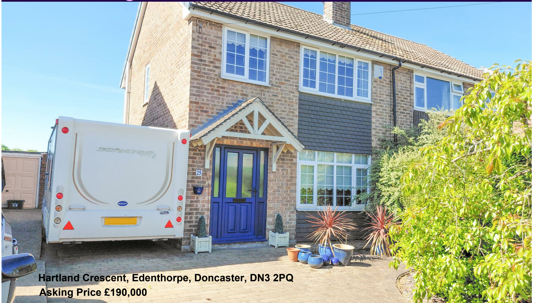
Hartland Crescent, Edenthorpe, Doncaster, DN3 2PQ Asking Price £190,000