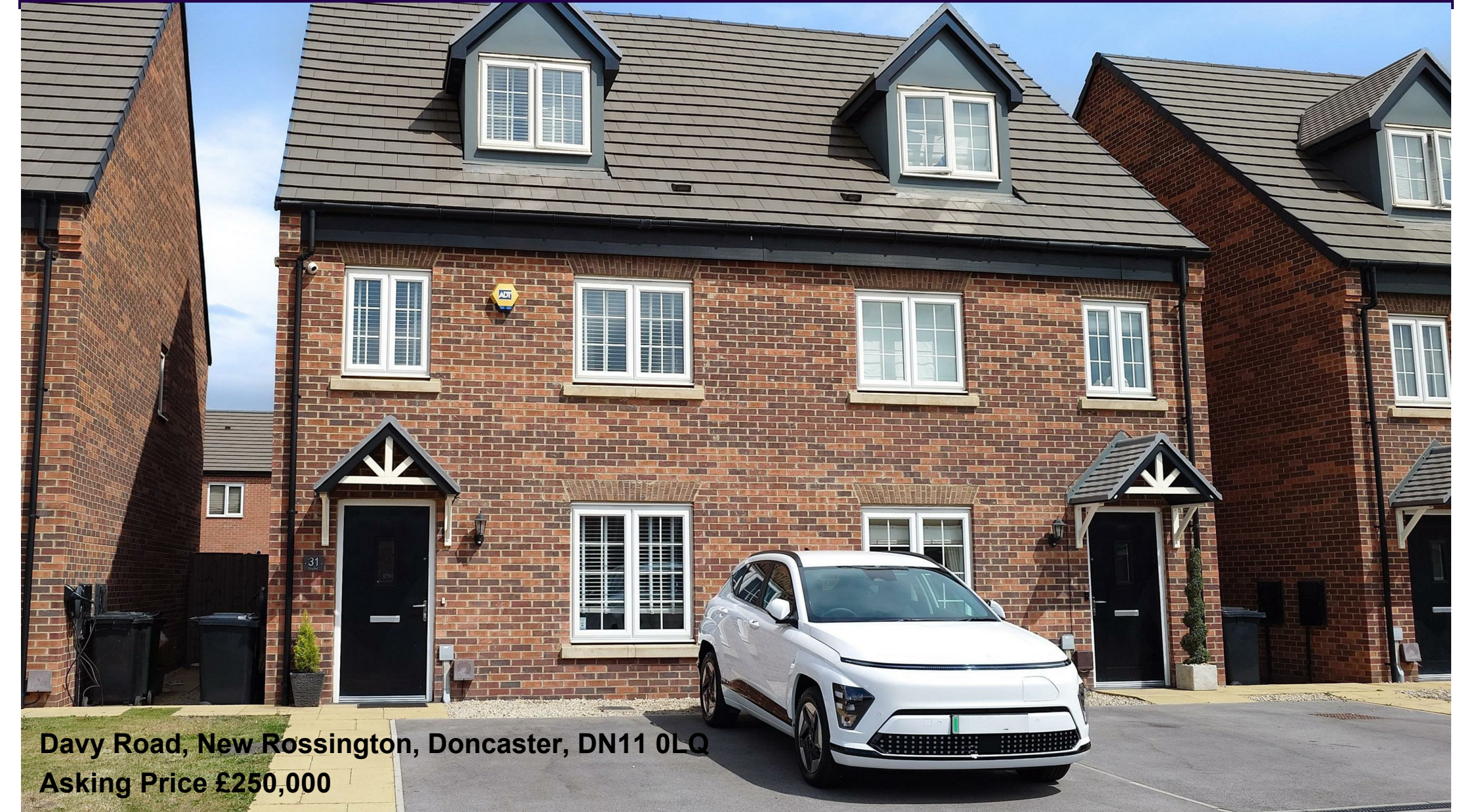
Davy Road, New Rossington, Doncaster, DN11 0LQ Asking Price £250,000